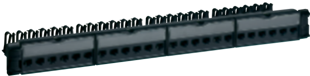
0 335 62