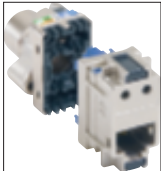
Cat. 6 connector STP shielded