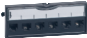
0 335 65